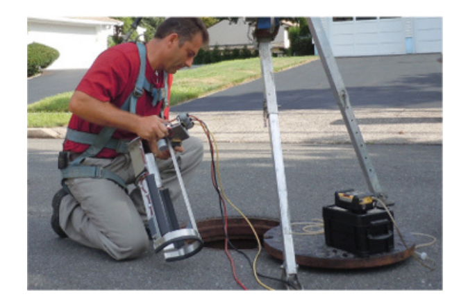
Figure 5: NIST traceable Billing Meter monitors flow from neighboring communities

The Utility Authority billing meter is a combination Parshall Flume/ Ultrasonic Level Sensor. This type of meter is incapable of directly measuring flow but rather determines volume strictly by ascertaining level.