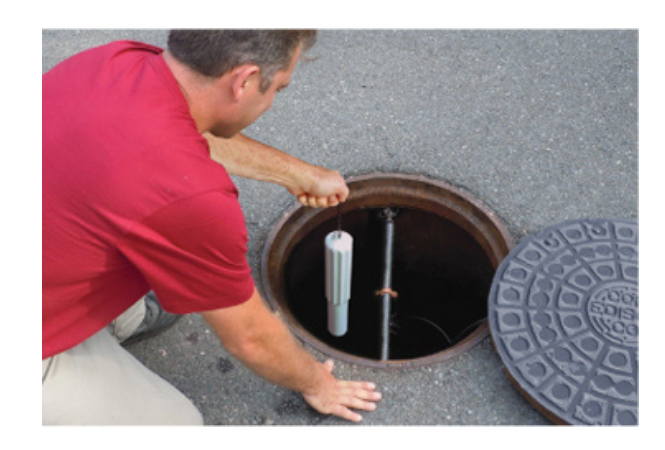
Figure 4: iTrackers become fully operational in 15 minutes without confined-space entry

The team began by employing a new and highly cost-efficient technology from Eastech that was capable of detecting, measuring, and locating I&I without the requirement for confined-space entry nor periodic maintenance (figure 4).